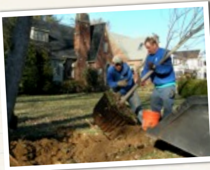
ANOTHER TREE GOES IN TO RESTORE THE BEAUTY OF RIEDLONN